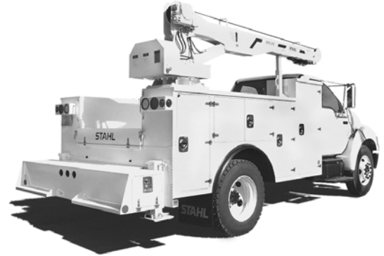
Shown with optional crane, bumper and manual outriggers.